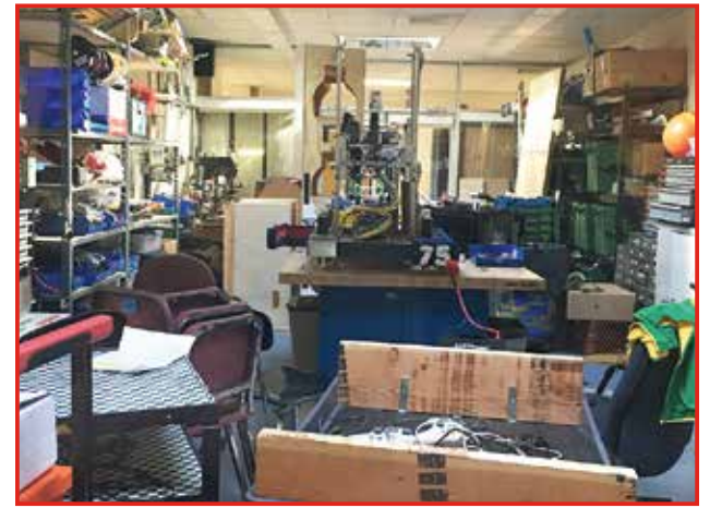
The space for Robotics at CSH Jr./Sr. High School is insufficient and can no longer accommodate the growing requirements of the program.