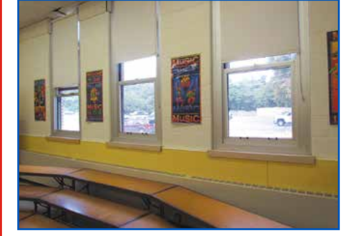
The music room at Goosehill Primary School does not adequately support the music program.