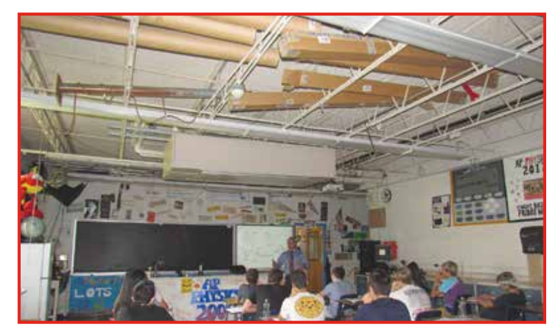
The current science classrooms are not able to support current and future curriculum needs.