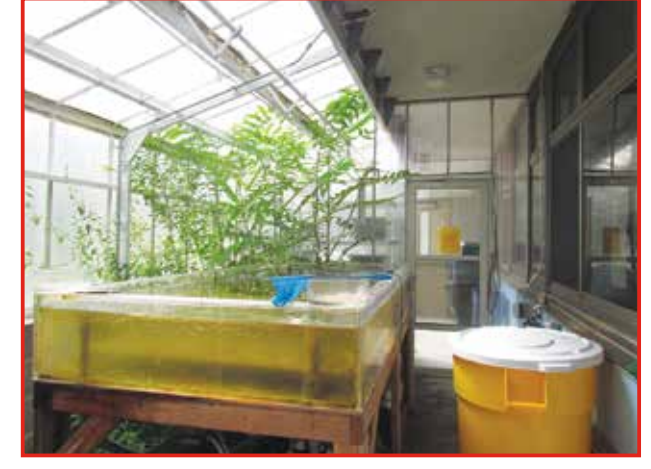
The current Coral Reef Project cannot survive in its current location at CSH Jr./Sr. High School.